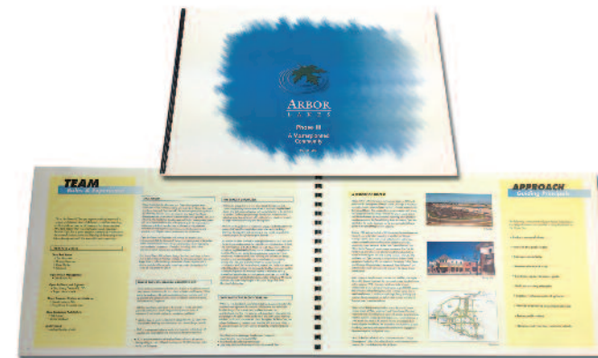
Maple Grove Arbor Lakes Phase III Development

Combine 5 entities to look as 1 and win the business. Successful.